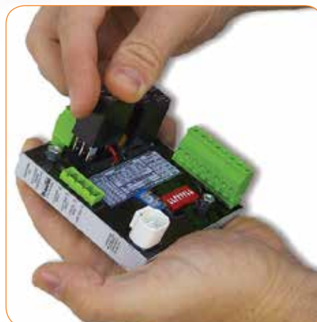
ES52 showing on-board 20A relays, fuses, and annunciator strip