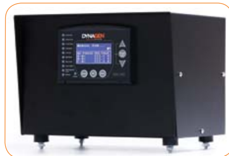
Also available with an optional control panel enclosure ( ENCO057 )