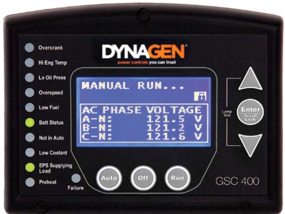
Compact 4.3" x 5.5" x 2.75" Footprint

The GSC400Plus is designed to provide complete control, protection, AC metering, and engine instrumentation for both standard and electronic engines and gensets. The module is easily configured using either the front panel buttons or our PC configurator software. The GSC400Plus provides direct mounting compatibility with other DynaGen controllers such as the GSC300 to allow for a full range of options to fit any application.